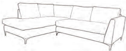
Corner Sofa LHF

Select the products that suit your living space. The images below detail the way in which the back, seat and scatter cushions are supplied.