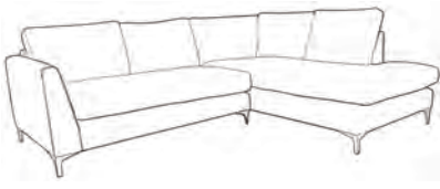
Corner Sofa RHF

Width: 246cm/96.9" Depth: 195cm/76.8" Height: 84cm/33.1"*